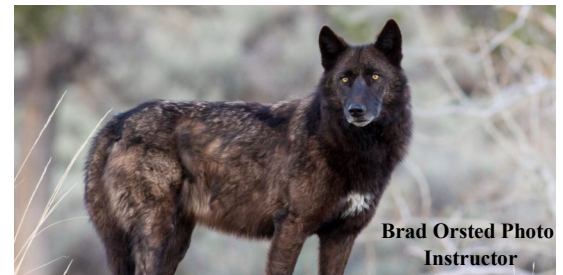
Brad Orsted Photo Instructor