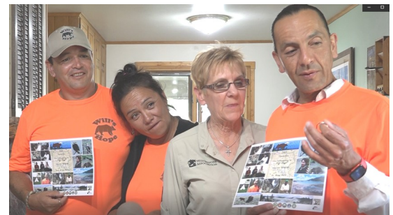
Native American Instructors