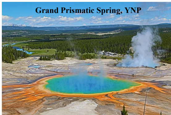
Grand Prismatic Spring, YNP

Will's Hope takes place in Yellowstone National Park (YNP) & the surrounding region in partnership with multiple organizations and native tribes. As a participant you will be able to witness & learn about one of the world's most diverse and dynamic regions.