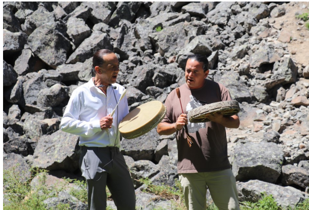
Native American songs & culture applicable to veterans